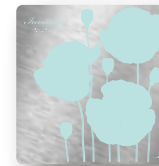
局部噴印架橋 (Portional printing primer)