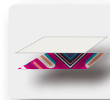
白色 + 彩色 (White Before)