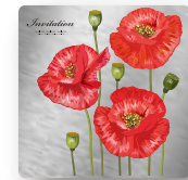
噴印彩色 (Color printing)