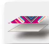
彩色 + 白色 (White After)